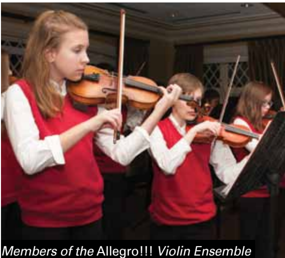
Members of the Allegro!!! Violin Ensemble

Trinity Services thanks everyone who made the event possible, including all sponsors, donors, guests and volunteers, as well as the dedicated members of the event's steering committee. The event's success will bolster Trinity's fulfillment of its mission in the year ahead.